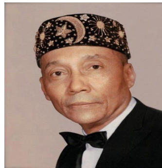
The Honorable Elijah Muhammad Messenger Of Allah

religion (Islam). Just when we thought education was expensive, along came ignorance or was it there all the time? Contributing factors to ignorance are blindness, deafness, and bringing up the rear-dumbness.