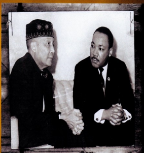
The Honorable Elijah Muhammad and Dr. Martin L. King, Jr. meet and discuss real Black unity and progress.

Farming: The Foundation of Self-Independence